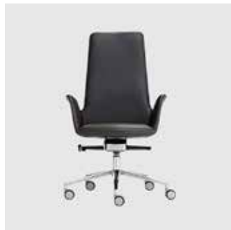
ALTEA HB/XL HB CASTOR Chair