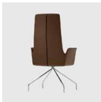
ALTEA HB SWIVEL Chair