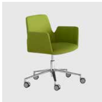
ALTEA 5-WAY CASTOR Chair