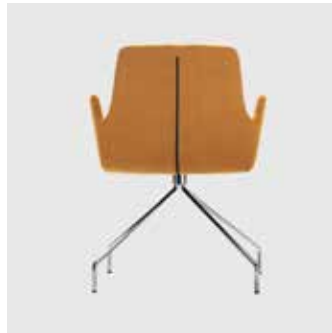
ALTEA 4-WAY SWIVEL Chair