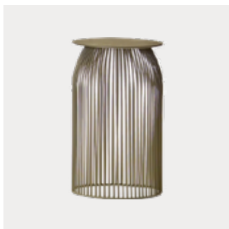
TURI TURI Occasional Table