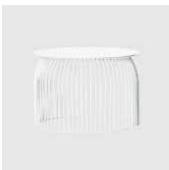
TURI TURI Occasional Table

DIMENSIONS DIA 500 H 350 (mm) DIA 700 H 300 (mm)