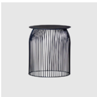
TURI TURI Occasional Table