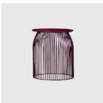
TURI TURI Occasional Table