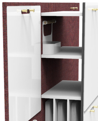
Retreat Workshop - storage compartment - top shelves