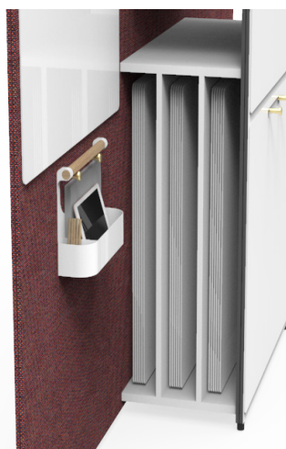
Retreat Workshop - storage compartment - bottom shelves