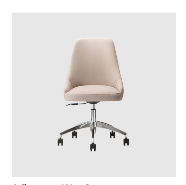
Adima o1 5-Way Castor TASK CHAIR TORRE