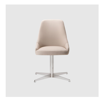
Adima 01 4-Way Pedestal CHAIR TORRE