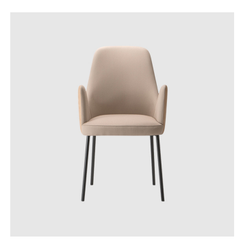
Adima 04 Metal 4-Leg ARMCHAIR TORRE