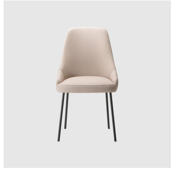
Adima o1 Metal 4-Leg CHAIR TORRE