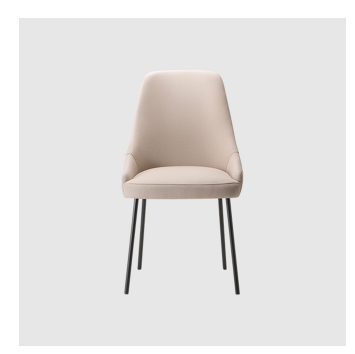
Adima o1 Metal 4-Leg CHAIR TORRE