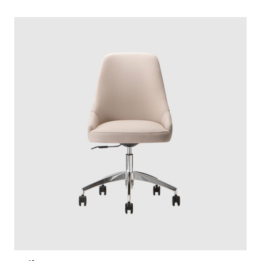
Adima o1 5-Way Castor TASK CHAIR TORRE