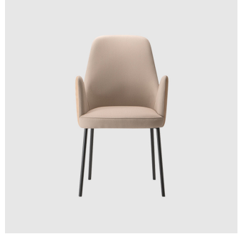
Adima 04 Metal 4-Leg ARMCHAIR TORRE