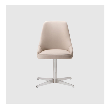
Adima 01 4-Way Pedestal CHAIR TORRE