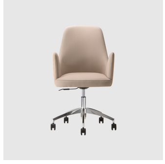
Adima 045-Way Castor TASK ARMCHAIR TORRE