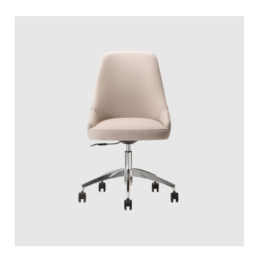
Adima o1 5-Way Castor TASK CHAIR TORRE