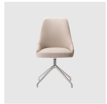
Adima o1 4-Way Swivel MEETING CHAIR TORRE