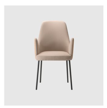
Adima 04 Metal 4-Leg ARMCHAIR TORRE