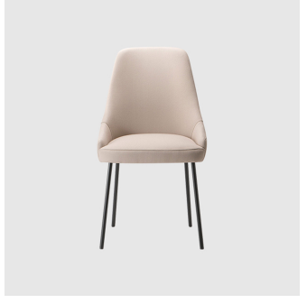
Adima o1 Metal 4-Leg CHAIR TORRE