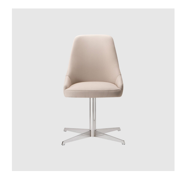
Adima 01 4-Way Pedestal CHAIR TORRE