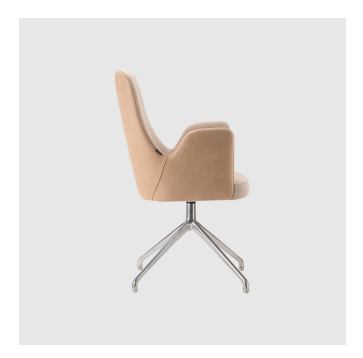
Adima 04 4-Way Swivel MEETING ARMCHAIR TORRE