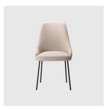
Adima o1 Metal 4-Leg CHAIR TORRE