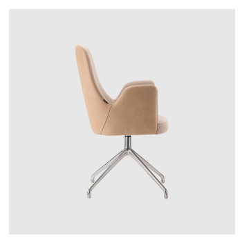
Adima 04 4-Way Swivel MEETING ARMCHAIR TORRE