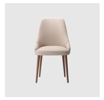
Adima o1 Timber 4-Leg CHAIR TORRE