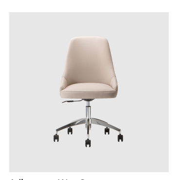
Adima o1 5-Way Castor TASK CHAIR TORRE