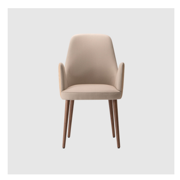
Adima 04 Timber 4-Leg ARMCHAIR TORRE