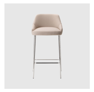
Adima o7 Metal 4-Leg STOOL TORRE