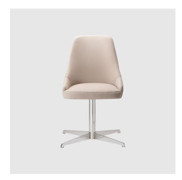
Adima 01 4-Way Pedestal CHAIR TORRE