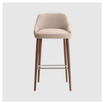
Adima o7 Timber 4-Leg STOOL TORRE