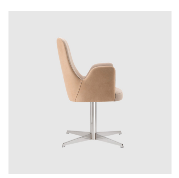
Adima 04 4-Way Pedestal ARMCHAIR TORRE