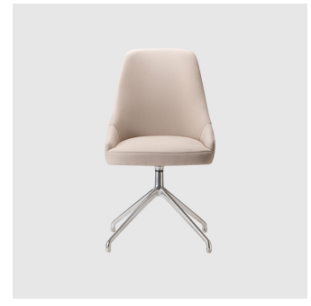
Adima o1 4-Way Swivel MEETING CHAIR TORRE