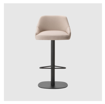
Adima o7 Pedestal STOOL TORRE