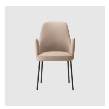
Adima 04 Metal 4-Leg ARMCHAIR TORRE