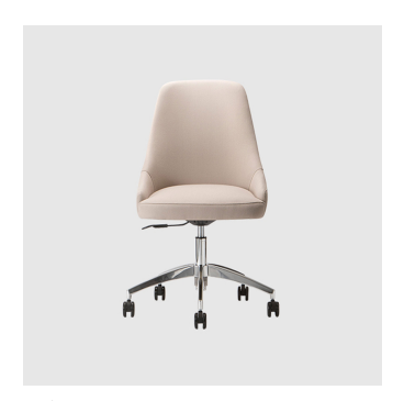
Adima o1 5-Way Castor TASK CHAIR TORRE