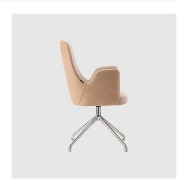
Adima 04 4-Way Swivel MEETING ARMCHAIR TORRE