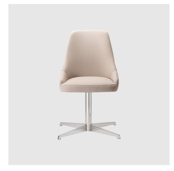
Adima 01 4-Way Pedestal CHAIR TORRE