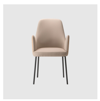
Adima 04 Metal 4-Leg ARMCHAIR TORRE