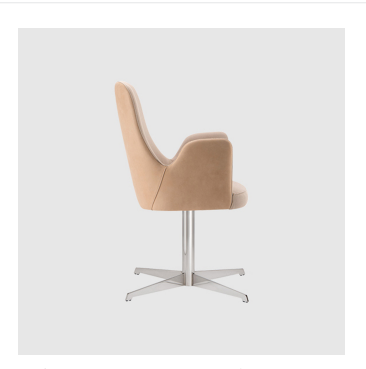
Adima 04 4-Way Pedestal ARMCHAIR TORRE