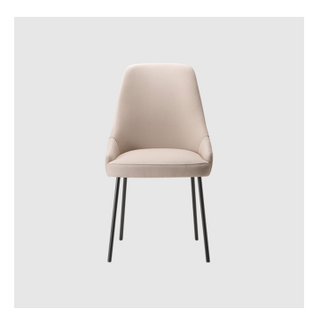
Adima o1 Metal 4-Leg CHAIR TORRE