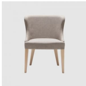
Agatha LOUNGE CHAIR ORIGINS 1971