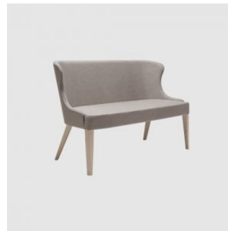
Agatha LOUNGE ORIGINS 1971