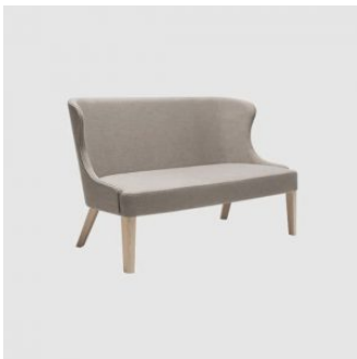
Agatha LOUNGE ORIGINS 1971