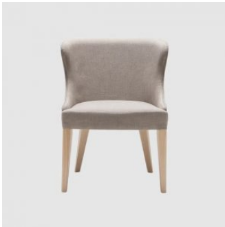
Agatha LOUNGE CHAIR ORIGINS 1971