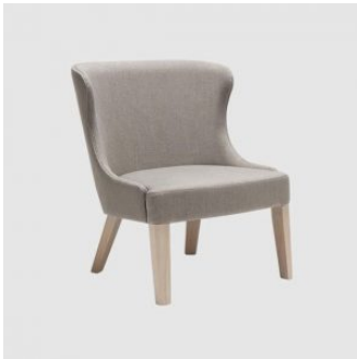
Agatha Low LOUNGE CHAIR ORIGINS 1971