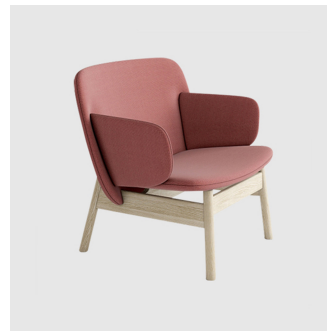
Ala Timber LOUNGE CHAIR LACIVIDINA