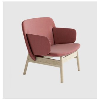
Ala Timber LOUNGE CHAIR LACIVIDINA