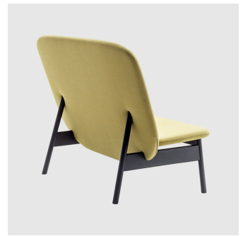
Ala Timber LOUNGE LACIVIDINA