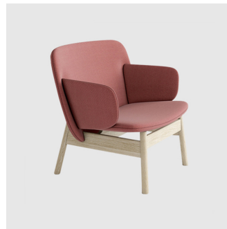
Ala Timber LOUNGE CHAIR LACIVIDINA