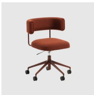
Amelie 5-Way Castor TASK ARMCHAIR MIDJ