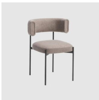
Amelie ARMCHAIR MIDJ