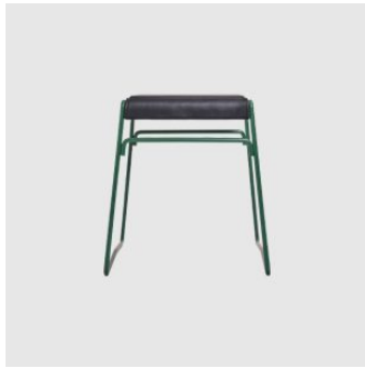
Angus Low STOOL REMINGTON MATTERS