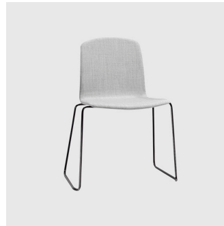
Ann Sled STACKING CHAIR INCLASS