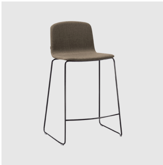
Ann Sled STOOL INCLASS