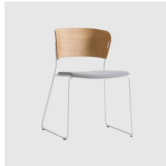
Arc Sled STACKING CHAIR INCLASS