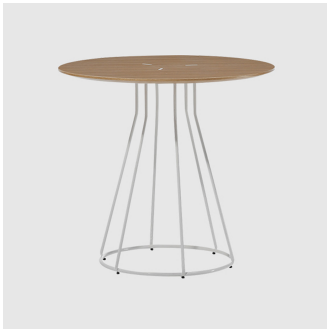
Arc MEETING/DINING TABLE INCLASS