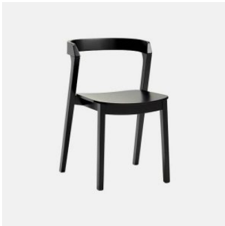
Arco STACKING CHAIR CANTARUTTI