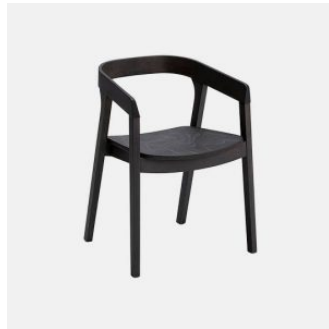
Arco ARMCHAIR CANTARUTTI