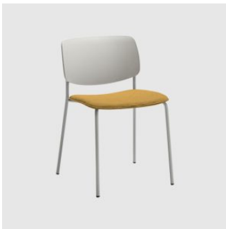
Aryn 4-Leg STACKING CHAIR INCLASS