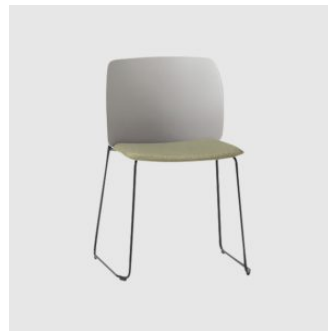
Aryn Max Sled STACKING CHAIR INCLASS