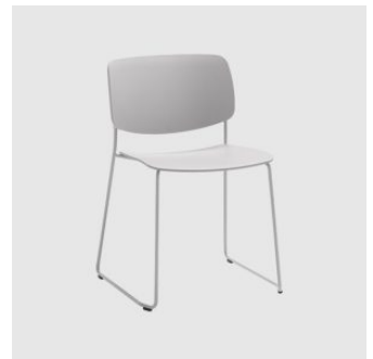
Aryn Sled STACKING CHAIR INCLASS