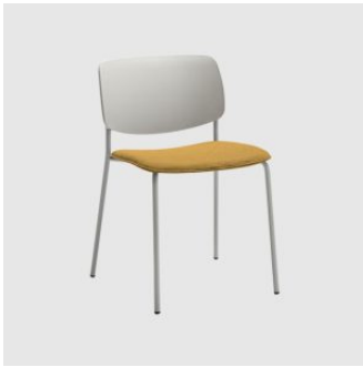
Aryn 4-Leg STACKING CHAIR INCLASS