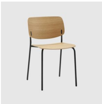
Aryn Wood 4-Leg STACKING CHAIR INCLASS