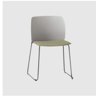
Aryn Max Sled STACKING CHAIR INCLASS