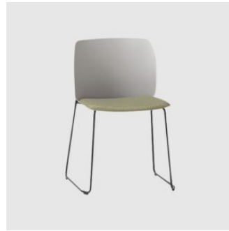
Aryn Max Sled STACKING CHAIR INCLASS