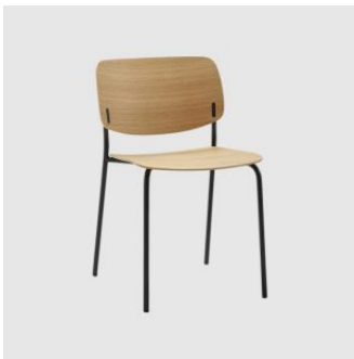
Aryn Wood 4-Leg STACKING CHAIR INCLASS