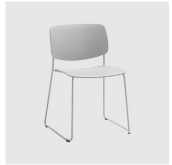
Aryn Sled STACKING CHAIR INCLASS