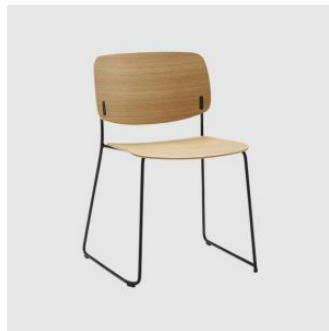
Aryn Wood Sled STACKING CHAIR INCLASS