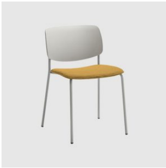
Aryn 4-Leg STACKING CHAIR INCLASS