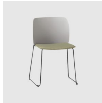
Aryn Max Sled STACKING CHAIR INCLASS