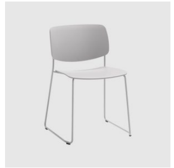
Aryn Sled STACKING CHAIR INCLASS