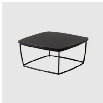
Bernard SIDE/COFFEE TABLE LACIVIDINA