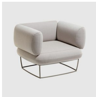
Bernard LOUNGE CHAIR LACIVIDINA