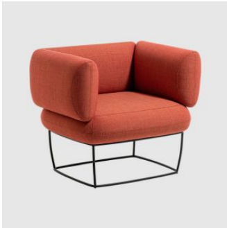
Bernard Compact LOUNGE CHAIR LACIVIDINA