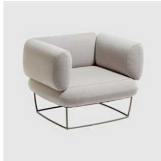
Bernard LOUNGE CHAIR LACIVIDINA