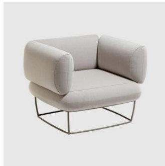
Bernard LOUNGE CHAIR LACIVIDINA