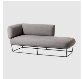
Bernard CHAISE LOUNGE LACIVIDINA