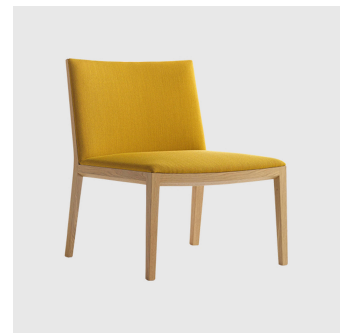
Bianca Light LOUNGE CHAIR CRASSEVIG