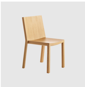
Bianca STACKING CHAIR CRASSEVIG