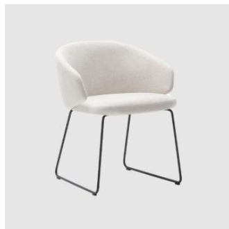
Binar 60 Sled ARMCHAIR INCLASS