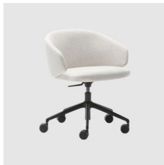
Binar 60 5-Way on Castors TASK ARMCHAIR INCLASS