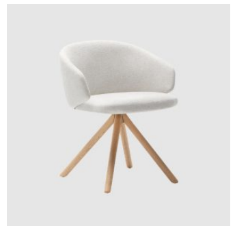
Binar 60 Timber Trestle MEETING ARMCHAIR INCLASS