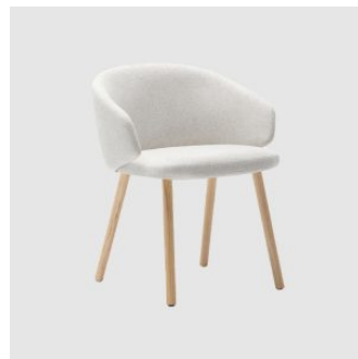
Binar 60 Timber 4-Leg ARMCHAIR INCLASS