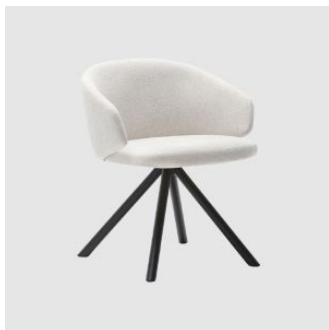
Binar 60 Metal Trestle MEETING ARMCHAIR INCLASS