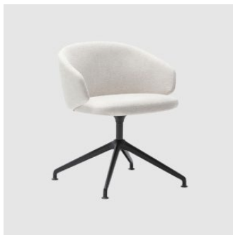
Binar 60 Metal 4-Way Swivel MEETING ARMCHAIR INCLASS