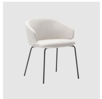
Binar 60 Metal 4-Leg ARMCHAIR INCLASS