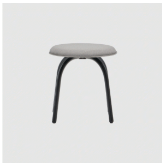
Bowler Backless Low