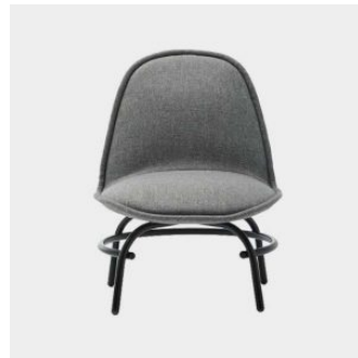
Bowler LOUNGE CHAIR BLASCO&VILA