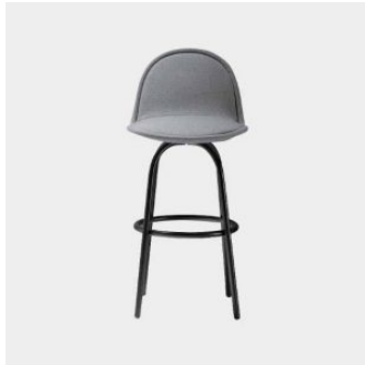
Bowler STOOL BLASCO&VILA