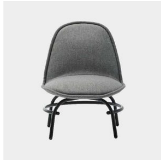
Bowler LOUNGE CHAIR BLASCO&VILA