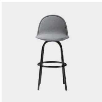
Bowler STOOL BLASCO&VILA