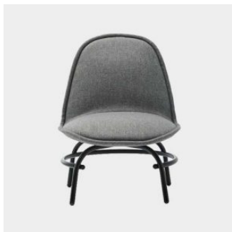
Bowler LOUNGE CHAIR BLASCO&VILA