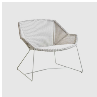
Breeze LOUNGE CHAIR CANE-LINE