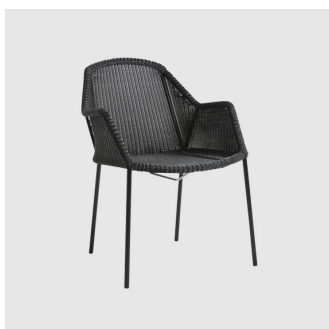
Breeze STACKING CHAIR CANE-LINE