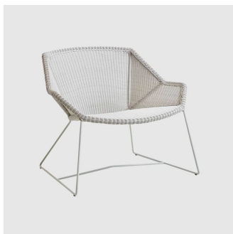
Breeze LOUNGE CHAIR CANE-LINE