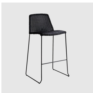
Breeze STOOL CANE-LINE