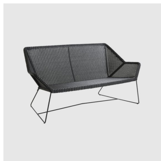
Breeze LOUNGE CANE-LINE