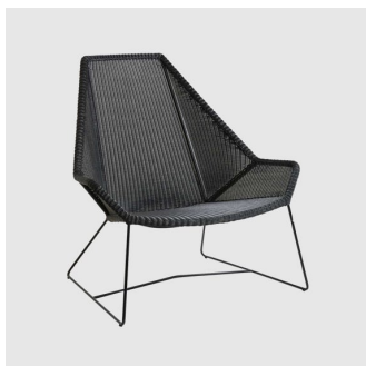
Breeze Highback LOUNGE CHAIR CANE-LINE