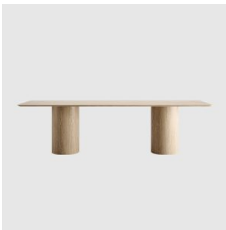
Bruce Timber COUNTER/BAR HEIGHT OWNWORLD