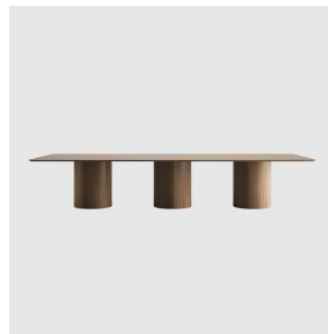
Bruce Timber Multibase MEETING/DINING OWNWORLD