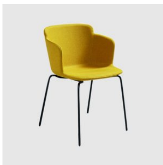
Calla P M 4-Leg ARMCHAIR MIDJ