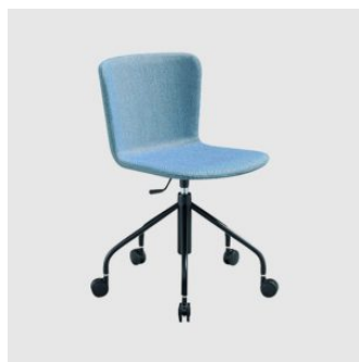
Calla DS 5-Way Castor TASK CHAIR MIDJ