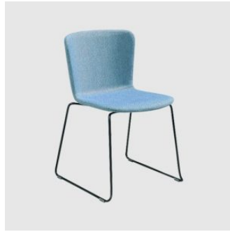
Calla S M Sled CHAIR MIDJ