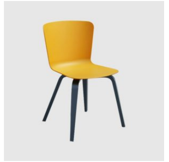
Calla S M Timber 4-Leg CHAIR MIDJ