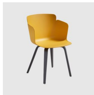
Calla P L Timber 4-Leg ARMCHAIR MIDJ