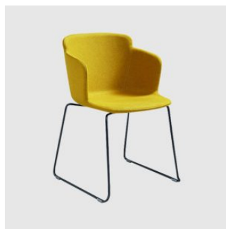
Calla P M Sled ARMCHAIR MIDJ