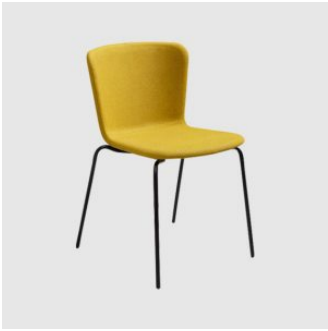
Calla S M 4-Leg CHAIR MIDJ