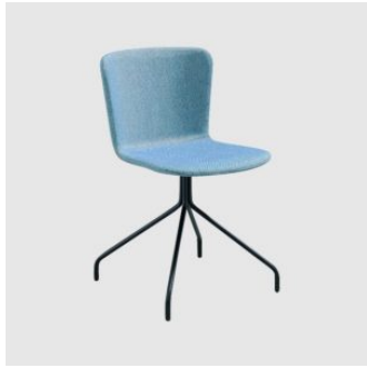
Calla S M 4-Way Swivel MEETING CHAIR MIDJ