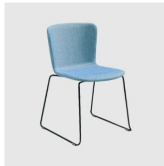
Calla S M Sled CHAIR MIDJ