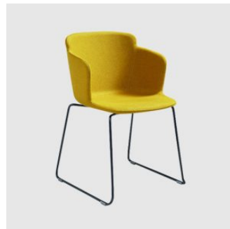
Calla P M Sled ARMCHAIR MIDJ