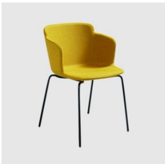
Calla P M 4-Leg ARMCHAIR MIDJ