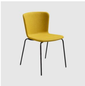
Calla S M 4-Leg CHAIR MIDJ