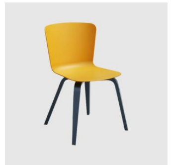
Calla S M Timber 4-Leg CHAIR MIDJ