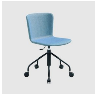
Calla DS 5-Way Castor TASK CHAIR MIDJ