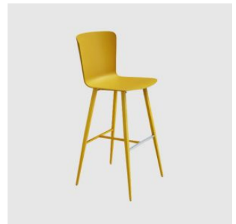
Calla S 4-Leg STOOL MIDJ