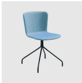
Calla S M 4-Way Swivel MEETING CHAIR MIDJ