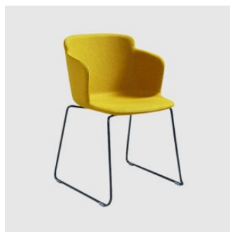
Calla PM Sled ARMCHAIR MIDJ