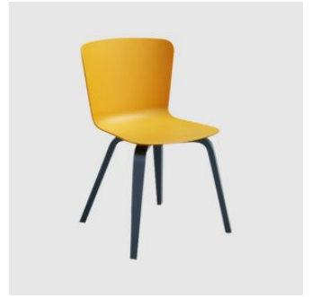
Calla S M Timber 4-Leg CHAIR MIDJ