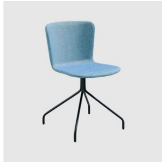
Calla S M 4-Way Swivel MEETING CHAIR MIDJ