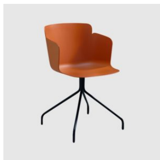
Calla PM 4-Way Swivel MEETING ARMCHAIR MIDJ