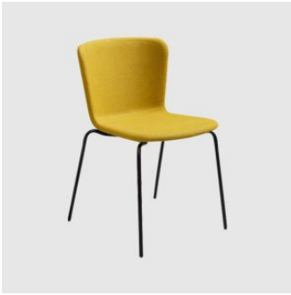
Calla S M 4-Leg CHAIR MIDJ