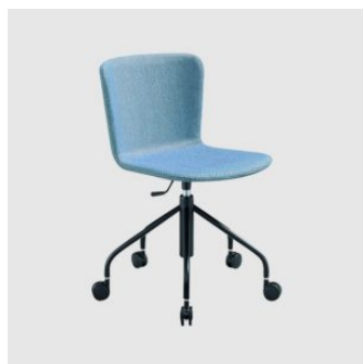
Calla DS 5-Way Castor TASK CHAIR MIDJ