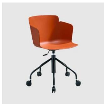
Calla DP 5-Way Castor TASK ARMCHAIR MIDJ