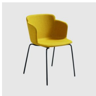
Calla PM 4-Leg ARMCHAIR MIDJ