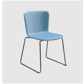
Calla S M Sled CHAIR MIDJ