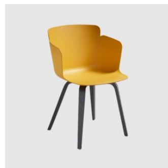
Calla P L Timber 4-Leg ARMCHAIR MIDJ