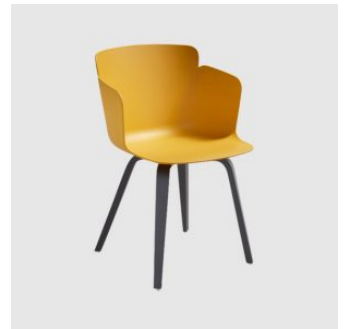
Calla PL Timber 4-Leg ARMCHAIR MIDJ