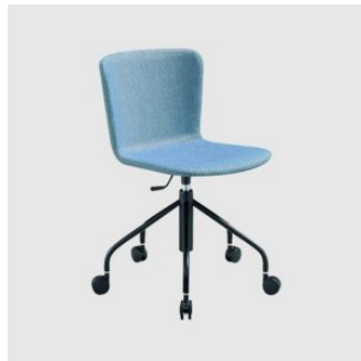
Calla DS 5-Way Castor TASK CHAIR MIDJ