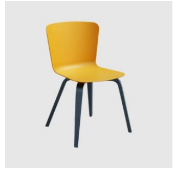
Calla S M Timber 4-Leg CHAIR MIDJ