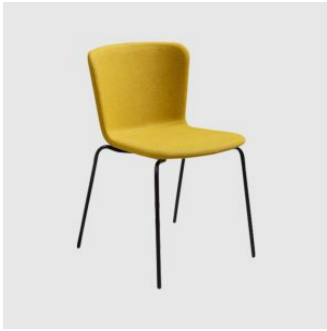
Calla S M 4-Leg CHAIR MIDJ