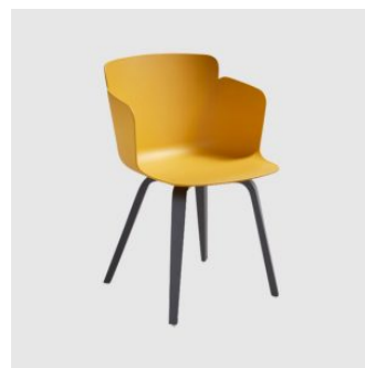
Calla P L Timber 4-Leg ARMCHAIR MIDJ