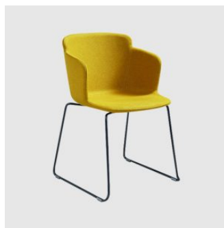
Calla P M Sled ARMCHAIR MIDJ