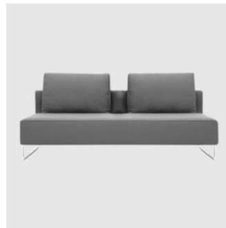
Canyon LOUNGE BENSEN