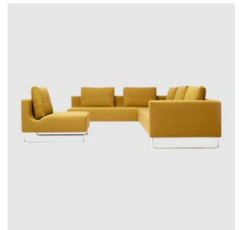
Canyon Sectional MODULAR LOUNGE BENSEN