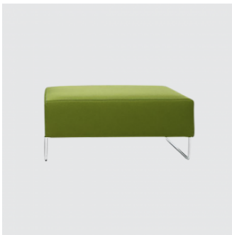
Canyon OTTOMAN BENSEN