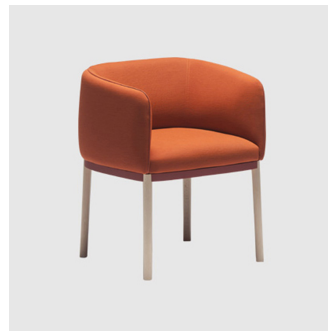
Cape ARMCHAIR LIVONI