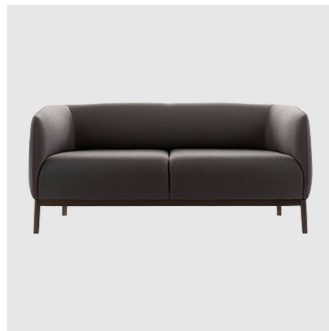
Cape LOUNGE LIVONI