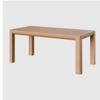
Frankie MEETING/DINING TABLE ALOR