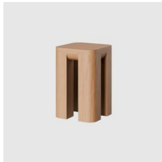
Sammy SIDE/COFFEE TABLE ALOR