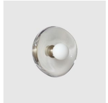
Gem WALL LAMP ALOR