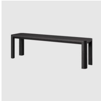
Bowie BENCH ALOR