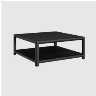
Kris SIDE/COFFEE TABLE ALOR