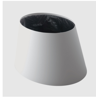
Conee BIN SYSTEMTRONIC