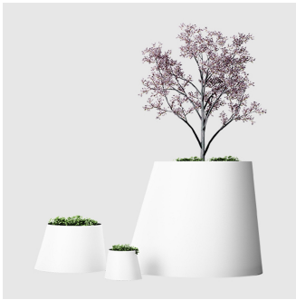
Conee PLANTER SYSTEMTRONIC