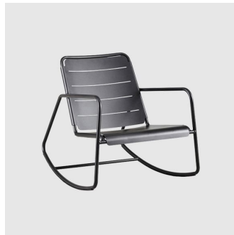
Copenhagen ROCKING CHAIR CANE-LINE