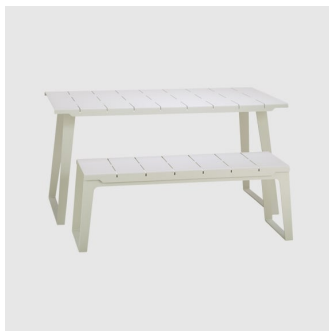
Copenhagen CAFÉ/DINING TABLE CANE-LINE