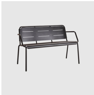
Copenhagen LOUNGE CANE-LINE