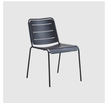
Copenhagen CHAIR CANE-LINE