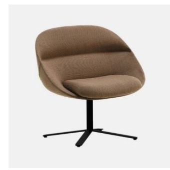
Cori 4-Way Pedestal LOUNGE CHAIR CANTARUTTI