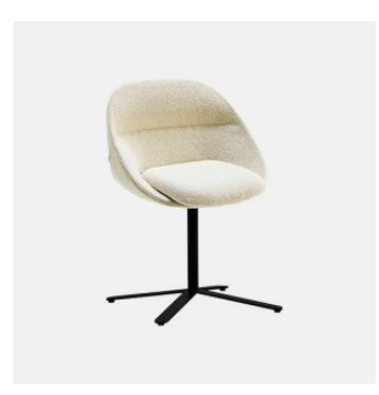
Cori 4-Way Pedestal MEETING ARMCHAIR CANTARUTTI