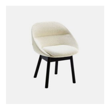
Cori Timber 4-Leg ARMCHAIR CANTARUTTI