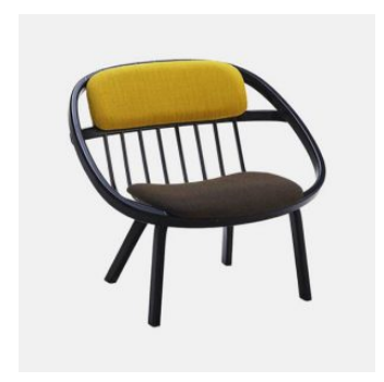
Cori Open Back Lounge Chair LOUNGE CHAIR CANTARUTTI