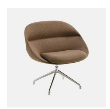
Cori 4-Way Swivel LOUNGE CHAIR CANTARUTTI