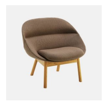
Cori Timber 4-Leg LOUNGE CHAIR CANTARUTTI