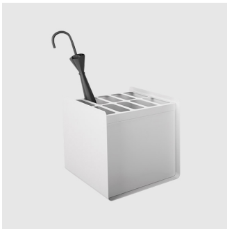
Crepe UMBRELLA STAND SYSTEMTRONIC