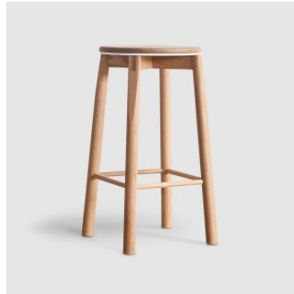
Crop STOOL OWNWORLD