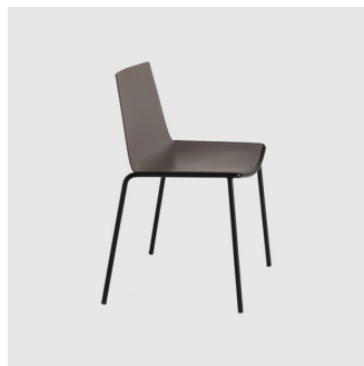
Cuba 4-Leg STACKING CHAIR ET AL.