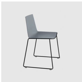
Cuba Sled STACKING CHAIR ET AL.