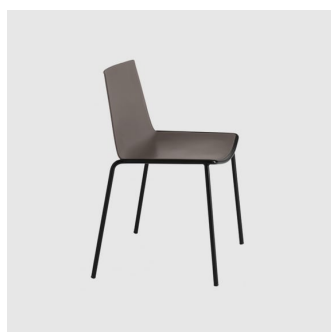
Cuba 4-Leg STACKING CHAIR ET AL.