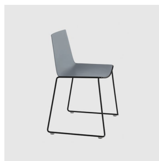
Cuba Sled STACKING CHAIR ET AL.